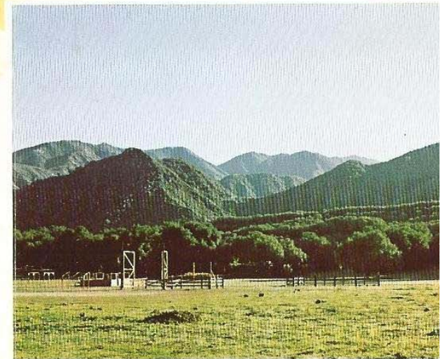
Meadow and Landing Strip at SABLE RANCH

Please call for reservations. Special rates for advertising agencies.