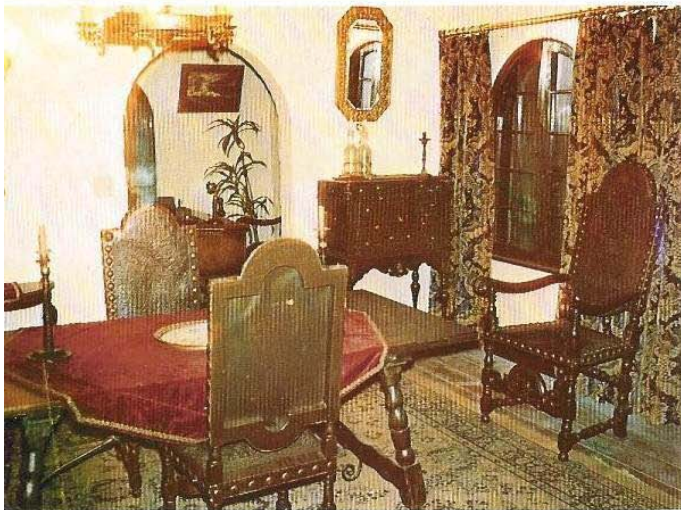
Interior of Hacienda